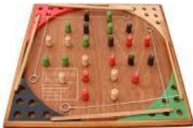
JEU DE PÊCHE