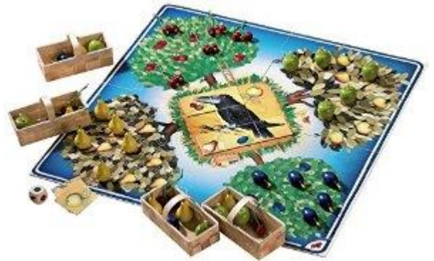
LE VERGER GEANT