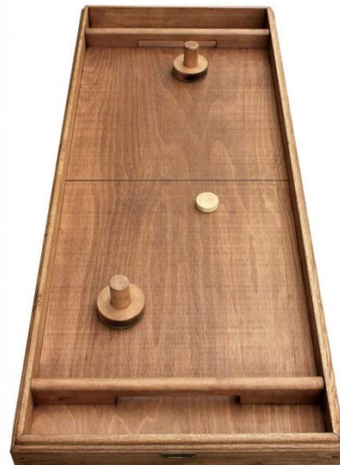
TABLE A GLISSER